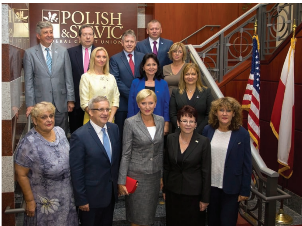
First Lady of Poland with representatives of the PSFCU Board of Directors, Supervisory Committee and Management