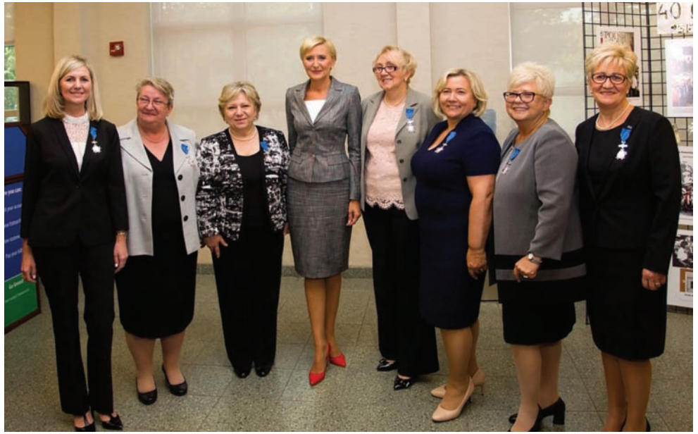
First Lady with decorated PSFCU employees

Cabinet Chief of the President of Poland presented the PSFCU management with a Polish flag on the occasion of the 40th