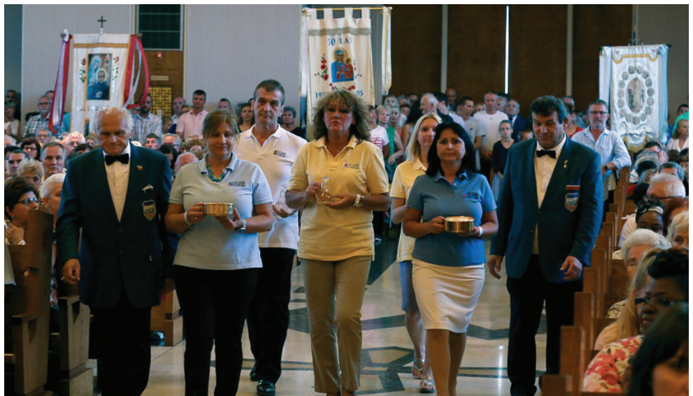
Representatives of the PSFCU Board of Directors during the Holy Mass celebrated at the Sanctuary in Doylestown, PA