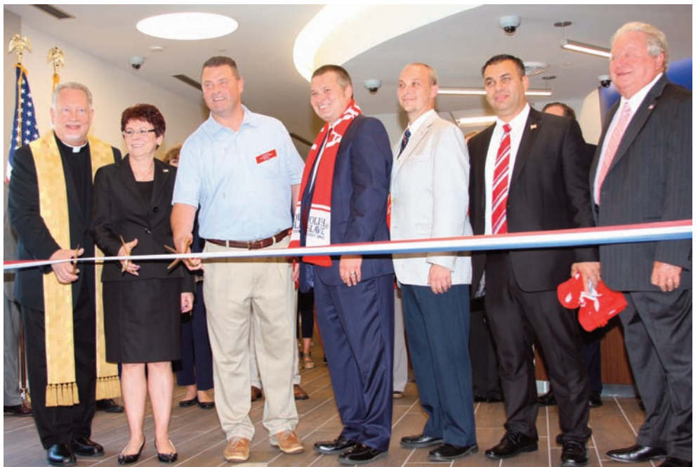
Cutting of the ribbon during the PSFCU Wallington branch grand opening ceremony.