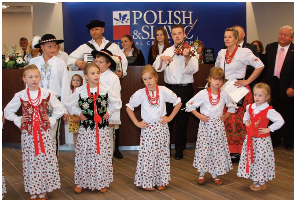
The “Podhalanie” highlander ensemble sang and danced to close the official part of the proceedings

The PSFCU’s new Wallington branch was designed to be functional, as well as