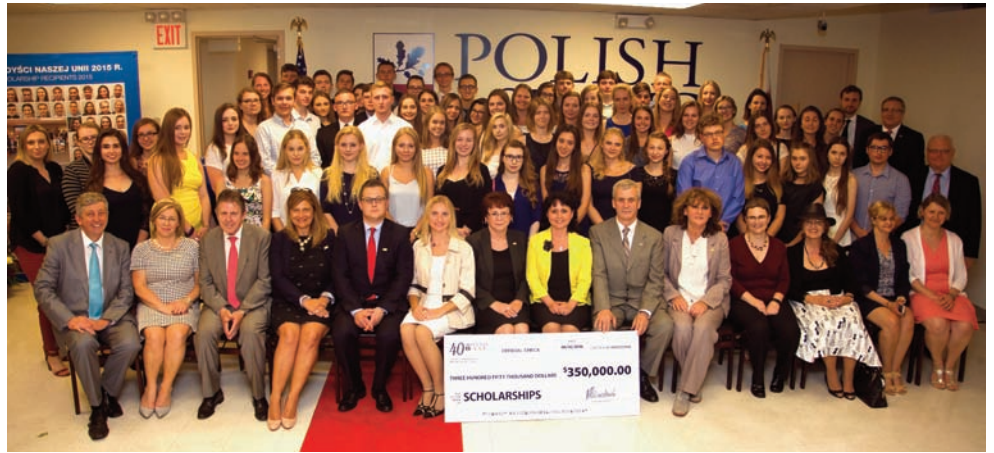
Commemorative photo during the PSFCU scholarship award ceremony in New York

At the credit union's first scholarship ceremony in 2001, only local Brooklyn students had gotten scholarships to continue their education. Today – more