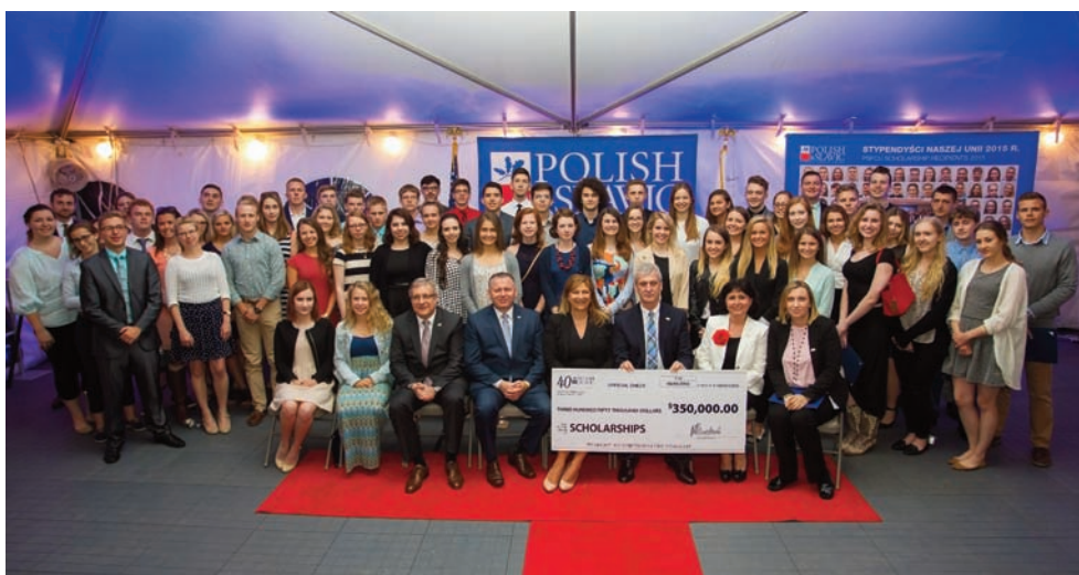
PSFCU award ceremony in Fairfield, New Jersey