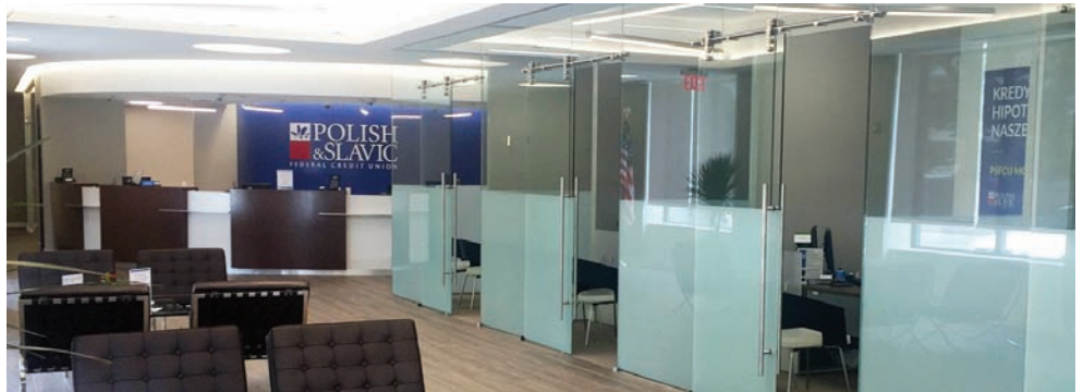
Interior of the PSFCU branch in Wallington, NJ

For the first time, the Polish & Slavic Federal Credit Union will be the main sponsor of the 29th Polish Marian Walking Pilgrimage. It will take place on August 13-14 and pilgrims will walk the traditional route from St. Michael's Church in southern Chicago, via the Shrine of Our Lady of Ludzmiierz in Muster, Indiana, to the Shrine of Our Lady of Czestochowa in Merrillville, Indiana. You are welcome to participate in the pilgrimage, which ends with a solemn Sunday Mass at 2:00 p.m. for the thousands of pilgrims and attendees.