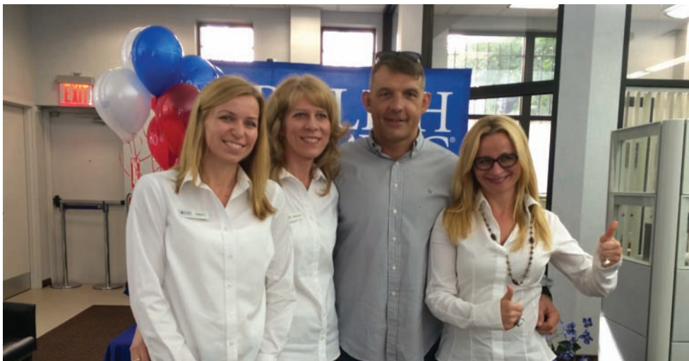
Commemorative photo with employees of the PSFCU branch in Ridgewood