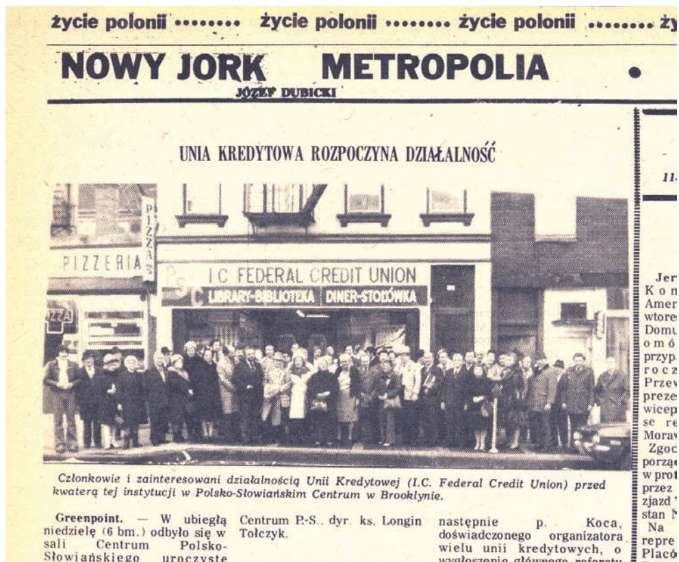
A fragment of the Polish Daily News issue dated March 10, 1977

In its eleventh year of operation, our Credit Union symbolically crossed the Hudson River. In 1987 we opened our second branch in Union, New Jersey. In subsequent years we continued to expand and new branches were opened on Kent Street in Greenpoint (1992), Boro Park in Brooklyn (1996) and in Clifton, New Jersey (1996).