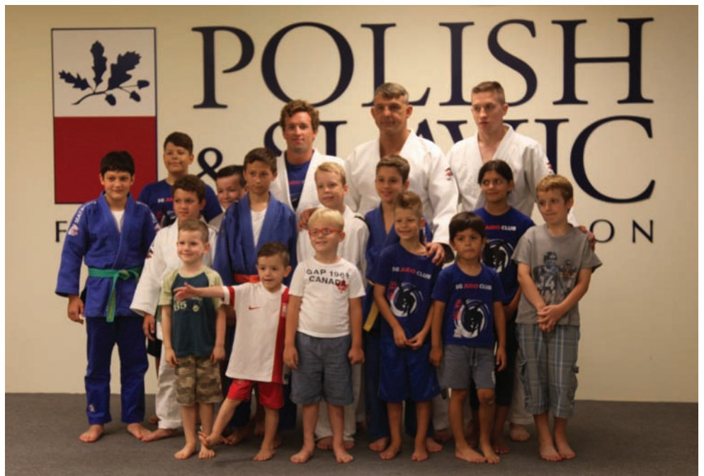
Mini training with Pawel Nastula, Olympic Champion and double World Champion in judo