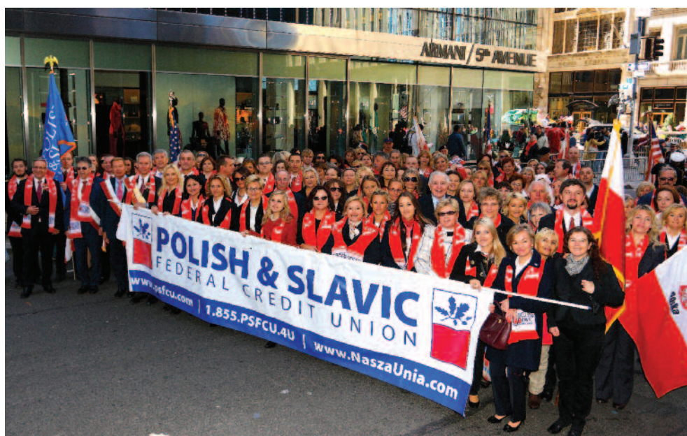
PSFCU contingent during the 78th Pulaski Parade in Manhattan