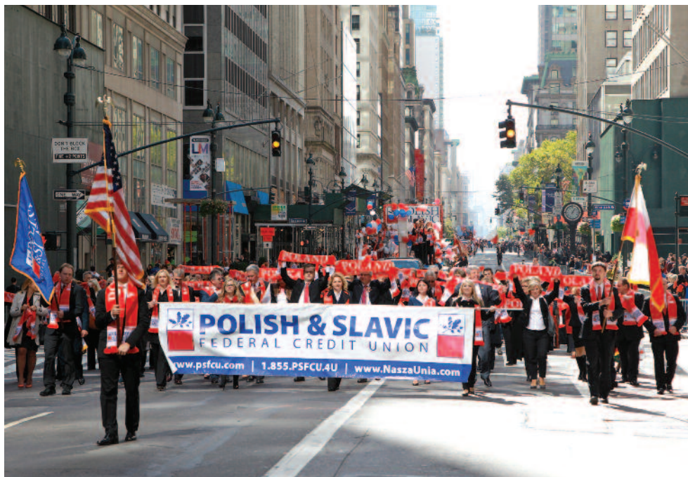
PSFCU employees marching up Fifth Avenue in Manhattan

This year, representatives of the Polish & Slavic Federal Credit Union also participated in the Pulaski Day Parade which went down the Benjamin Franklin Parkway in Philadelphia. Employees of our Credit Union's Trenton branch marched through the streets of the city, accompanied by our Mobile Branch.