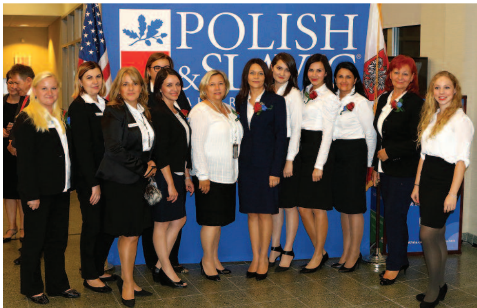
PSFCU McGuinness branch employees during the 10th Anniversary celebrations

The branch at 100 McGuinness Blvd was opened in 2005 in the building which also houses the headquarters of the PSFCU. Since then, the facility has gained 5,780 Credit Union members, who have deposited funds amounting to almost $138,000,000, and have taken out loans amounting to $269,000,000. PSFCU's McGuinness Branch provides services to a total of 6,500 members of our Credit Union.