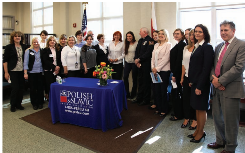
Justyna Kowalczyk with representatives of the PSFCU Board of Directors and McGuinness branch employees

Besides the meetings with fans at PSFCU branches, Justyna Kowalczyk was the guest of honor at the second edition of the Polonia 5K Run in Wallington, New Jersey. Unfortunately, the two-time Olympic gold