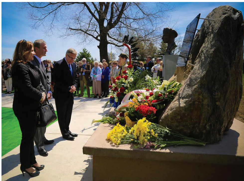
PSFCU delegation lays flowers under the Smolensk plaque at the Doylestown Sanctuary cemetery