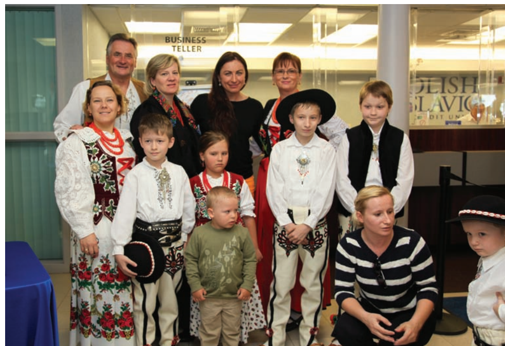
Olympic Champion at the PSFCU branch in Clifton

Those of you who send us interesting materials will participate in the drawing of attractive gifts - you will have a chance to win one of 10 PSFCU T-shirts autographed by Polish champions from Sochi Winter Olympics: Zbigniew Brodka or Justyna Kowalczyk.