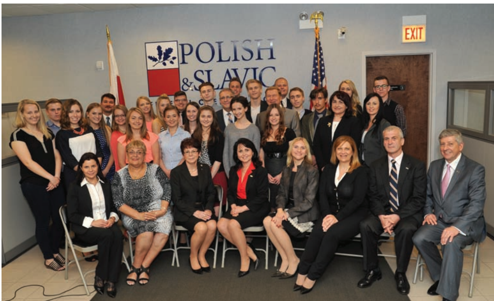
In Illinois, the scholarship ceremony was held at the PSFCU branch in Mt. Prospect