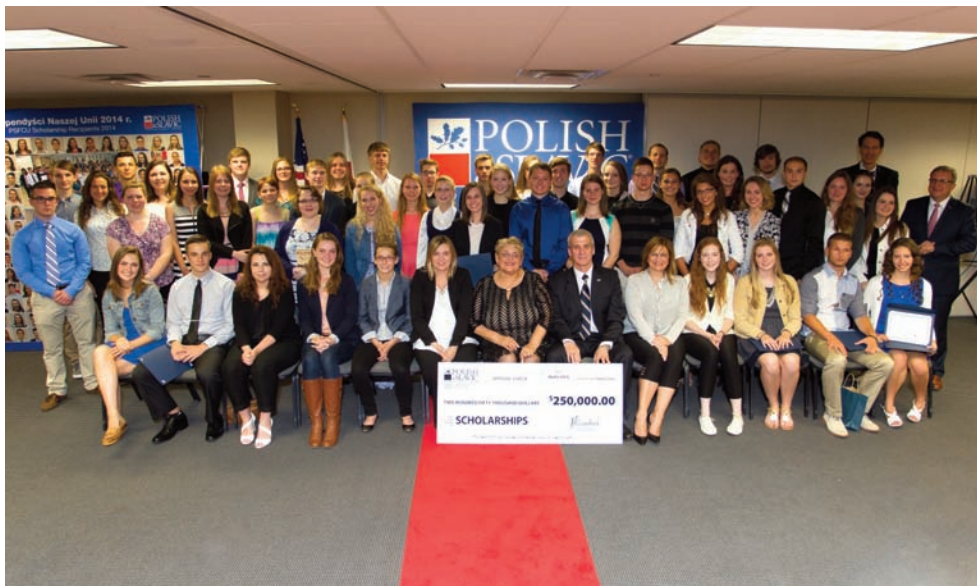
Scholarship ceremony at the PSFCU Operations Center in Fairfield, NJ

A total of over $3,250,000 in funds has been allocated toward scholarships since the beginning of the PSFCU Scholarship Program in 2001. Almost 2,800 high school graduates and college students have benefited from scholarships through all those years. Thanks to this support, young members of our Credit Union have been able to study at prestigious universities such as Harvard, Yale, Columbia, Princeton, Stanford, New York University and the Massachusetts Institute of Technology. Our Credit Union’s Scholarship Program is just one example of our support to Polish immigrants in making their “American dream” come true.