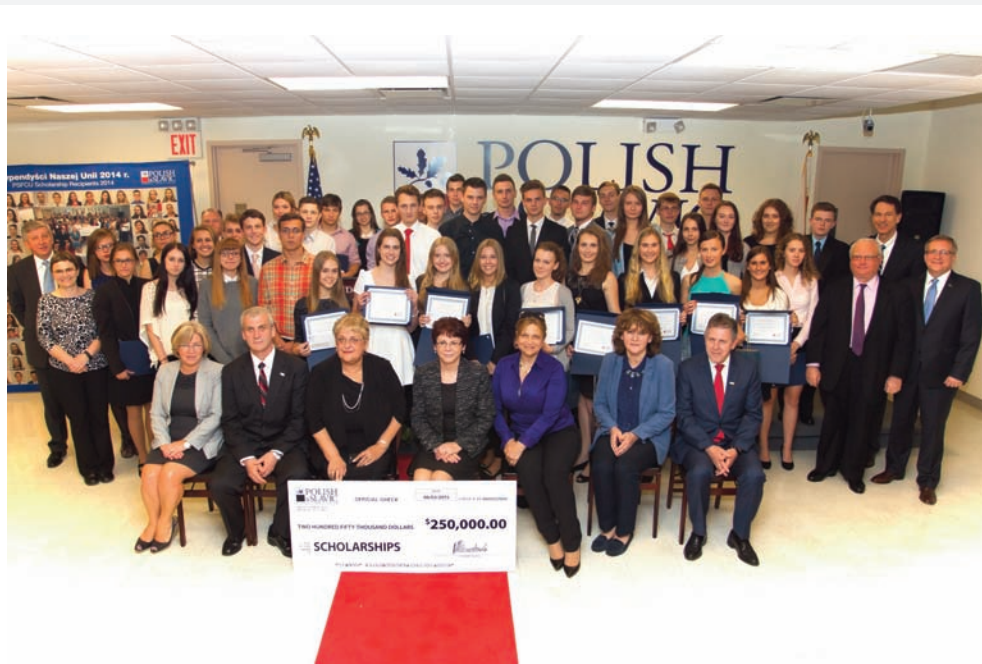
PSFCU scholarship ceremony at the Credit Union headquarters located at 100 McGuinness Blvd. in Greenpoint