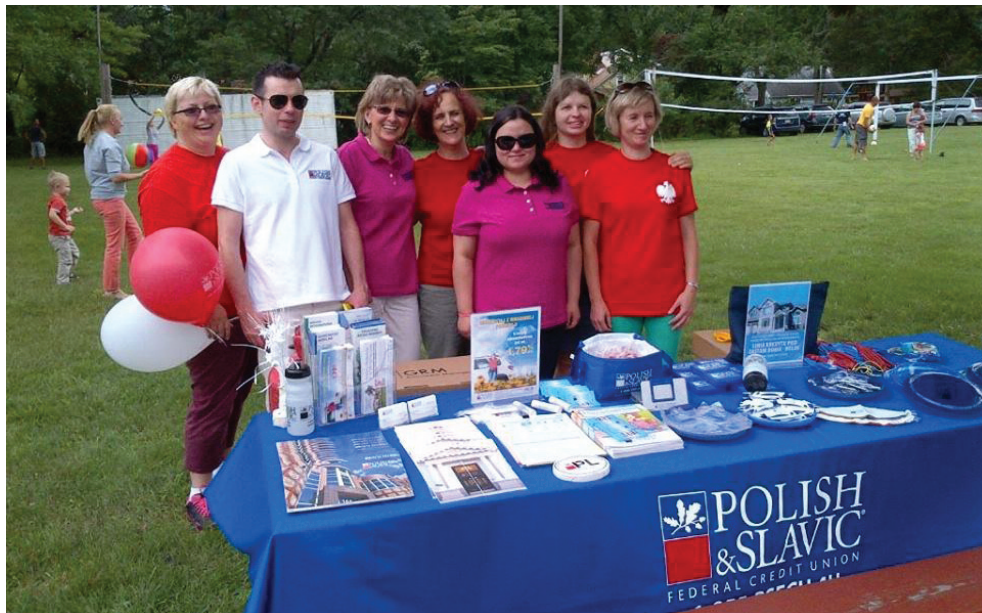
PSFCU staff at a community picnic in Trenton, NJ

blare of the horn greeted scouts from the Polish Scouting Organization every new day at camp at the American Czestochowa in Doylestown, next to the Pauline Fathers sanctuary. This year the camp was transformed into a Piast castle and the children learned about the beginnings of Polish statehood under the Piast Dynasty up until the Baptism of Poland in 966. The PSFCU supported the two-week outing of the cubs and scouts from New York's Podhale Troop. We are proud to have been able to help Polish-American children on their educational trip to the historical roots of Poland.