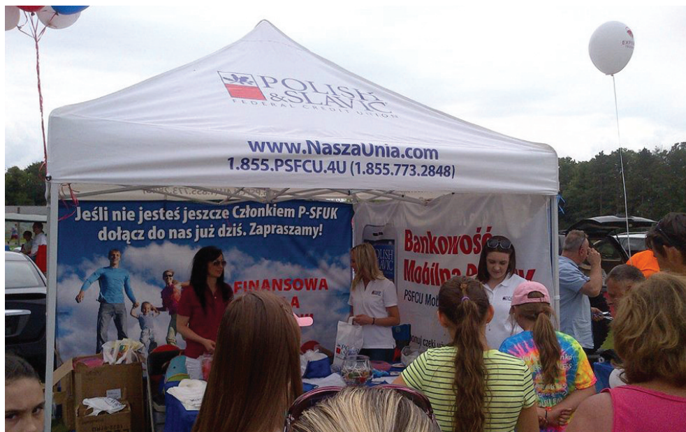
PSFCU tent at a community picnic in Yorkville, IL