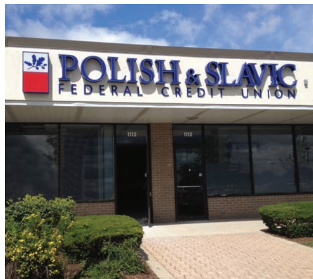
New PSFCU branch in Schaumburg

The PSFCU has been operating in Illinois since 2010, when two branches in the Chicago area were opened, in Mt. Prospect and Norridge. A year later they were joined by a third branch in Bridgeview, in the southern part of the metropolis, a neighborhood inhabited mainly by Polish highlanders. A presence of over five years in Illinois is a great success for our Credit Union. According to data from late June 2015, in that time the PSFCU has acquired 13,086 members and $122,800,000 in deposits, and extended loans totaling $ 131,300,000.