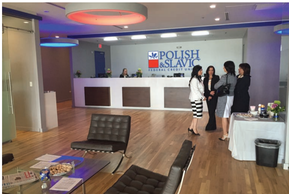
Interior of the PSFCU branch in Schaumburg

The new Schaumburg branch was opened to meet the demand for the Polish financial institution's services in Chicago and environs. It also shows how right the PSFCU management was when it decided that we had to expand the Credit Union's operations outside New York and New Jersey. In keeping with our mission, the Credit Union strives to locate wherever there are Polish population centers in the United States, and through its operations it intends to contribute to strengthening the financial standing and prestige of the Polish American community.