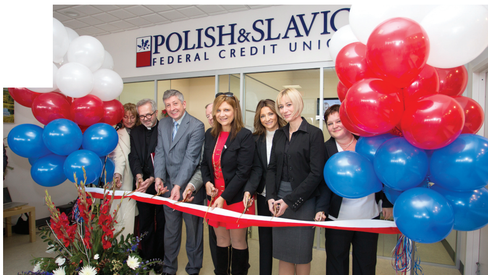
Ceremonial cutting of the ribbon during the Staten Island branch Grand Opening festivities