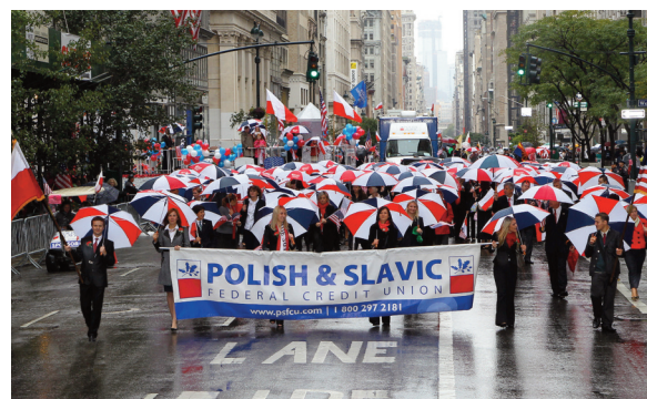
PSFCU contingent marches during this year's Pulaski Parade

After our contingent finished marching, many employees returned to the Parade route to cheer on other Polonia organizations, who for several