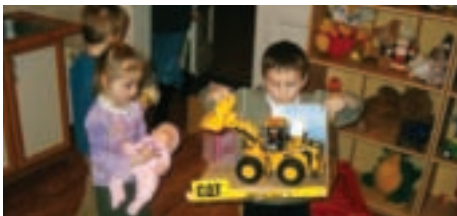
Children in Chociule orphanage unwrap the presents

This year we chose at random two orphanages: one in Katy Wroclawskie and the other in Cieszyn. Gifts for 65 children were shipped well ahead of Christmas to make sure they would reach their destination on time. Over 100 employees, and the members of the Board of Directors took part in this year's program. We look forward to keeping up the tradition.