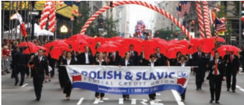
PSFCU at the Pulaski Parade – 5th Ave & 42nd St