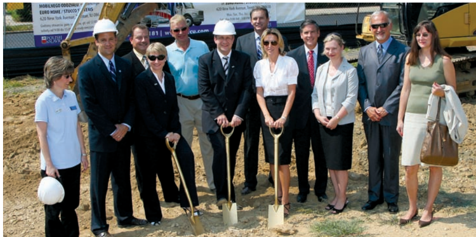
PSFCU extends its reach